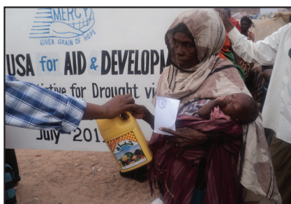
Food distribution to famine-affected families in Somalia.

From September 2011 to September 2012, Mercy-USA for Aid and Development distributed hot meals twice daily to over 300 elderly persons, displaced women and children living in camps in Mogadishu. Mercy-USA also operated three clinics in Mogadishu that examined and treated hundreds of patients displaced by severe drought and famine.