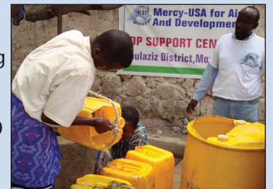
Families affected by drought and famine collecting fresh water from a new well dug by Mercy-USA in Mogadishu.

Since 1997, Mercy-USA has played a vital role in providing safe drinking water in Somalia, digging and repairing 258 wells. Communities with a combined population of over 515,000 persons are benefiting from this safe water program. According to studies carried out by UNICEF, only about one-third of families in Somalia have access to clean drinking water.