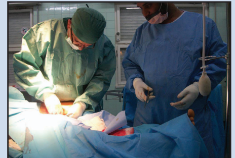
Mercy-USA sponsored surgeons operating in Libya.

During their various rotations, Mercy-USA supported medical teams in eastern Libya examined and treated over 20,000