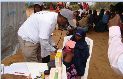
A Mercy-USA health worker examining a young child during an outreach session at a camp in Mogadishu for families displaced by famine and drought.

With almost $3.9 million in grant funding from the US Agency for International Development (USAID) and UNICEF, Mercy-USA is providing health, nutrition and safe water to women, children and their families in Somalia. Beneficiaries include 58,000 children under five, over 11,000 pregnant women and nursing mothers, as well as over 40,000 internally displaced persons.