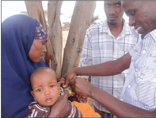
A child under 5 being examined for malnutrition in Garissa County, Kenya during a community outreach program.

Mercy-USA for Aid and Development and the Kenyan Ministry of Health (MoH) - with the support of the US Agency for International Development (USAID) and UN Children's Fund (UNICEF) - have set up 40 sites in Kenya's Garissa County to treat malnourished children under five years of age, as well as pregnant women and nursing mothers. Mercy-USA expects to treat and counsel approximately 22,900 children and 8,200 women. This life-saving nutrition program is being implemented in primarily pastoral (livestock herding) communities affected by a prolonged drought.