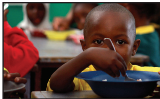
A child at KDNS enjoying school lunch provided by Mercy-USA.