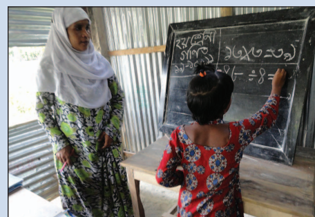
A girl and her teacher at a Mercy-USA funded school in Bangladesh during math class.

From July 2010 to December 2011, Mercy-USA for Aid and Development supported five community-based primary schools run by our local partner, Assistance for Humanitarian Development (AHD), in Bangladesh. These schools, located in very low-income areas in Kakua, Tangail, Rangpur, Sirajgonj and Delda, are providing free education for approximately 900 vulnerable children.