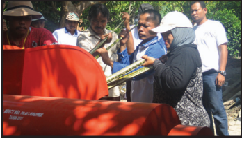
Farmers in Indonesia making animal feed with a machine provided by Mercy-USA.