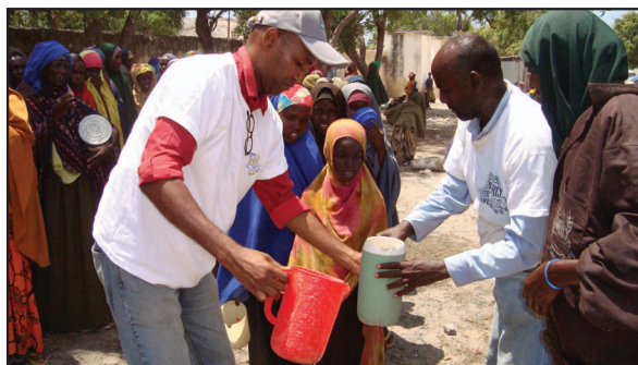
Mercy-USA providing hot breakfast to children and women at a camp for families displaced by famine and drought in Mogadishu.

From July to September 2011, Mercy-USA distributed rice, flour, beans and oil to about 4,100 famine-displaced families (about 24,500 persons). Mercy-USA also provided these families with 3,000 household kits. Each kit contained a sleeping mat, a wash bucket, a kettle, 2 jerry cans, 2 pots, 2 plates, 4 plastic cups and soap. In addition, we distributed 5,400 UNHCR-supplied blankets to 5,400 famine-displaced persons, as well as UNHCR-supplied plastic sheeting to 900 displaced families to help them build temporary shelter.