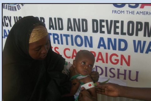
A Mercy-USA nutrition worker examining a baby in Somalia for malnutrition.

Somalia has one of the highest child and maternal mortality rates in the world. One in eight children dies before reaching the age of five and 1,600 women die for every 100,000 live births. Various UNICEF studies report that other social indicators for children are among the worst in the world: one in three children is chronically malnourished, hardly a third of families have access to clean