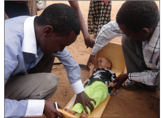
A nutrition worker checking the height and nutritional status of a young child during a Mercy-USA outreach program in Garissa County.

Mercy-USA for Aid and Development and the Kenyan Ministry of Health (MoH) - with the support of the US Agency for International Development (USAID) and UN Children's Fund (UNICEF) - have set up 40 sites in Kenya's Garissa County to treat malnourished children under five years of age, as well as pregnant women and nursing mothers. Mercy-USA expects to treat and counsel approximately 22,900 children and 8,200 women. This life-saving nutrition program is being implemented in primarily pastoral (livestock herding) communities affected by a prolonged drought.