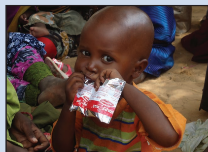
A malnourished child in Somalia eating Plumpy'Nut.

Somalia has one of the highest child and maternal mortality rates in the world. One in eight children dies before reaching the age of five and 1,600 women die for every 100,000 live births. Various UNICEF studies report that other social indicators for children are among the worst in the world: one in three children is chronically malnourished, hardly a third of families have access to clean