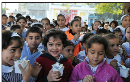
Children at one of eight schools in Gaza enjoying their daily lunch.

In 2011, Mercy-USA for Aid and Development partnered with the United Nations Relief and Works Agency for Palestine Refugees in the Near East (UNRWA) to provide daily school lunches to approximately 6,700 children attending 8 elementary and preparatory schools in Gaza. This project helped to improve the overall nutritional status of the children, as well as their academic performance.