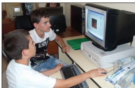
Orphans in Albania learning basic computer software.

Since January 2009, Mercy-USA for Aid and Development has been providing computer office software and English language training courses to orphans and other vulnerable youth in Albania. Trainees are also receiving education in important life skills and character-building combined with awareness of the danger of slipping into crime (drugs, prostitution, theft, etc.). Topics under character-building include the value of work versus waiting for handouts from others, respect for self and others, confidence, the value of