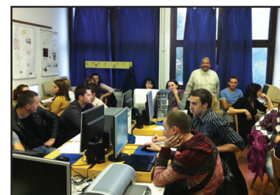
Computer software training course in Srebrenik, Bosnia.

Graduates of Mercy-USA's computer and English courses are also offered job search skills training. They are instructed on proper techniques for developing a resume, how to find job openings and interview skills.