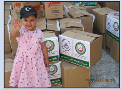
Food packages for vulnerable families in Nalut District, Libya.

From February to October 2011, the violence against the vulnerable people of Libya led to the deaths of over 25,000 persons, as well as injuries to more than 60,000 others. Mercy-USA for Aid and Development, in partnership with the Arab Medical Union (AMU) based in Cairo, Egypt, sent specialized physicians, surgeons and nurses to hospitals inside eastern Libya, Misrata and Zintan in the western part of the country.