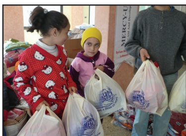
Young Syrian refugees in Lebanon receiving winter jackets to help keep them warm.

In 2011, the violence in Syria left thousands of civilians dead and injured. To escape the violence and save their lives, many families left the homes and took refuge in Turkey and Lebanon. They left with only what they could carry, seeking refuge in countries where they could guarantee their families' safety.