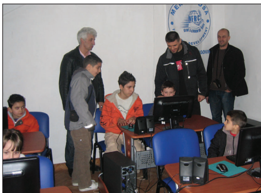
Orphans and other vulnerable children learning basic computer software in Bosnia.

In November 2010, Mercy-USA for Aid and Development began providing three-month computer office software training courses to orphans and other vulnerable youth in the Tuzla Canton of Bosnia. Trainees are also receiving education in important life skills and character-building combined with awareness of the danger of slipping into crimes (drugs, prostitution, theft, etc.). Topics under character-building include the value of work versus waiting for handouts from others, respect for self and others, confidence, the value of helping others, honesty and integrity. The orphans are also being provided with a nutritious meal/snack during each class. This project is being done in cooperation with local orphanages and municipalities.