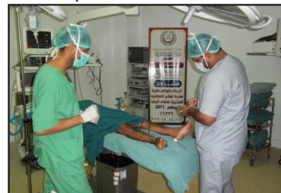
Mercy-USA sponsored orthopedic surgeons performing an operation in Sana'a, Yemen.

During 2011, Yemen's hospitals had an influx of patients with serious medical conditions that could not receive the aid they needed due to a shortage of specialized surgeons. Mercy-USA for Aid and Development, in partnership with the Arab Medical Union in Egypt, organized and sent specialized surgical teams to operate at the University of Science and Technology Hospital (USTH) in the capital city of Sana'a. These teams included orthopedic surgeons and neurosurgeons.