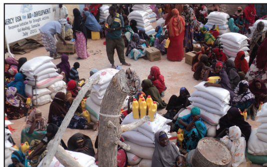
Mercy-USA relief workers distributing food to families affected by severe drought in Somalia.