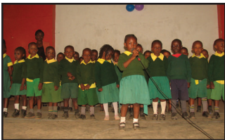
Children at KDNS performing on stage.

Below is specific information on the participating schools: