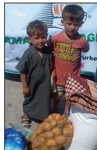
Syrian refugee children in Turkey with their food and household items provided by Mercy-USA.

In Turkey, Mercy-USA provided 3,000 family packages to the 3,000 refugee families living in 5 camps (Yayladagi, Boynuyogun, Altinozu, Reyhanli & Apaydin), with host families in 3 villages (Guvecci, Nishrin & Hasma) and in a small buffer zone along the border inside of Syria. Each family package contained baby formula and bottles, milk, watermelons and hygiene items (including diapers, baby wipes, cotton, baby cream, shampoo, laundry detergent, soap, tooth brushes, toothpaste and facial tissues). We also distributed 400 sets of foam mattresses, floor mats and blankets to 400 families in the Reyhanli camp.