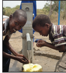
Children enjoying fresh water from a new Mercy-USA well in Ijara District, Kenya.

From October 2010 to July 2011, Mercy-USA for Aid and Development dug five wells in the Ijara District of Kenya's Garissa County. These wells are providing fresh water to approximately 1,380 persons daily.