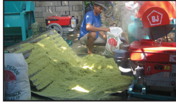
Farmers collecting and bagging the animal feed.

Since March 2011, Mercy-USA for Aid and Development has been providing livestock, feed-production machines, rice, corn and sweet potato seeds, fertilizer and training to farming families in three provinces of Indonesia. Mercy-USA is also supporting these farmers to form cooperatives. These agricultural inputs and training are helping these farmers and their families to increase their food production and income. As of December 2011, over 380 farming families (about 1,530 persons) have been supported.