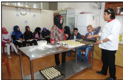
Orphans and other vulnerable youth learning to become pastry chefs in the Nahr Al-Bared Palestinian refugee camp.

From August 2010 to December 2011, Mercy-USA for Aid and Development supported vocational training programs for orphans and other vulnerable youth carried out by the Women's/Community Development Centers in Al-Beddawi and Nahr Al-Bared Palestinian refugee camps near Tripoli in the north of the country.