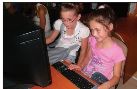
A Mercy-USA computer software class for orphans in Albania.

The orphans are also being provided with a nutritious meal/snack during each class. As of December 2011, approximately 380 orphans in Albania have successfully completed these courses.