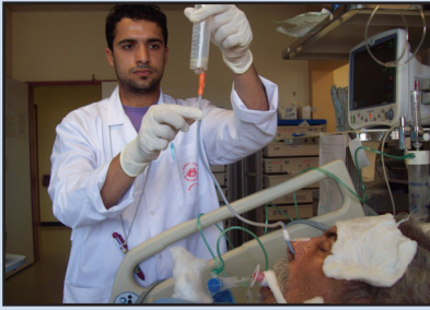
A Mercy-USA sponsored ICU nurse working at Benghazi Medical Center in Benghazi, Libya.

From February to October 2011, the violence against the vulnerable people of Libya led to the deaths of over 25,000 persons, as well as injuries to more than 60,000 others. Mercy-USA for Aid and Development, in partnership with the Arab Medical Union (AMU) based in Cairo, Egypt, sent specialized physicians, surgeons and nurses to hospitals inside eastern Libya, Misrata and Zintan in the western part of the country.