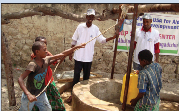
Children collecting fresh water for their families at a new well in Mogadishu, Somalia.

From August 2011 to January 2012, Mercy-USA for Aid and Development dug 44 new wells in Somalia. These wells - which were dug in Mogadishu (19 wells), Mudug Region (15 wells) and Galgaduud Region (10 wells) - are providing fresh drinking water to communities and villages with a total population of approximately 61,000 persons.