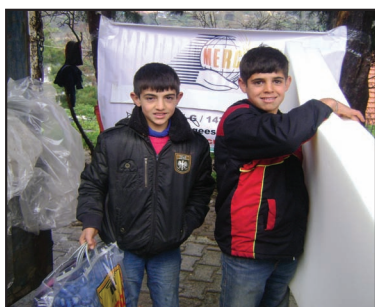
Young Syrian refugees in Turkey receiving mattresses and blankets for their families.

Mercy-USA has been working since 2011 to provide Syrian refugees with packages of food and basic household and hygiene products.