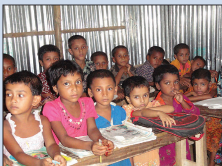
Children at one of five Mercy-USA funded schools in rural Bangladesh.

From July 2010 to December 2011, Mercy-USA for Aid and Development supported five community-based primary schools run by our local partner, Assistance for Humanitarian Development (AHD), in Bangladesh. These schools, located in very low-income areas in Kakua, Tangail, Rangpur, Sirajgonj and Delda, are providing free education for approximately 900 vulnerable children.