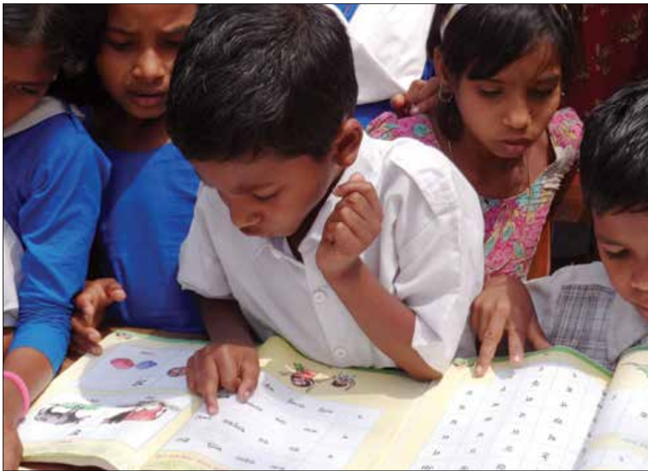
Mercy-USA supports five rural schools in Bangladesh with everything from books, uniforms, teacher salaries and meals.