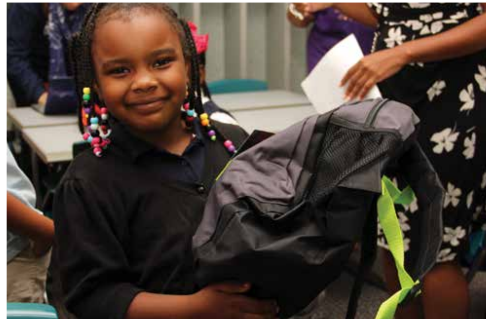
Kindergartners through 5th graders in Detroit had brand-new backpacks loaded with supplies waiting for them when they arrived on their first day of school in September, 2018.

For the second year, we sponsored backpacks and