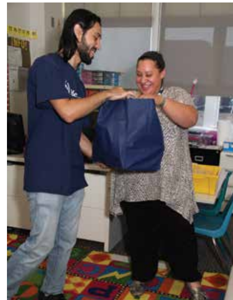
Teachers at all 3 schools in Detroit were gifted classroom supplies. Their smiles matched those of their students.

Inspired by the success of the program in Bosnia and our emphasis on education worldwide, we initiated the "We Care Backpacks" program for three Detroit public schools identified as having great need. Mercy-USA volunteers raised money, and assembled