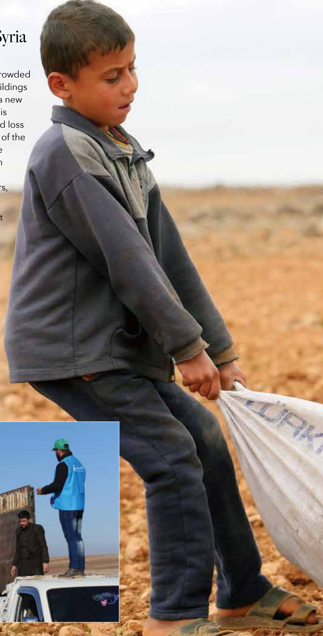
Surviving winter on the barren plains in Northern Syria in a sodden cloth tent is made more survivable with safe winter heating fuel and a vented stove.

This winter, with help from a generous grant from the United Nations and Mercy-USA donors, we are delivering cast iron stoves and three months of eco-friendly fuel to thousands of families. This fuel burns hotter than scarce wood or coal, and is safer for the environment as well. The bio-mass fuel is manufactured in nearby Turkey as well as in Syria from olive oil production waste. The cast iron stoves are vented and sturdy so not to be easily tipped by children. This project will keep children and the elderly safe from the freezing nighttime temperatures, especially while surviving in tents.