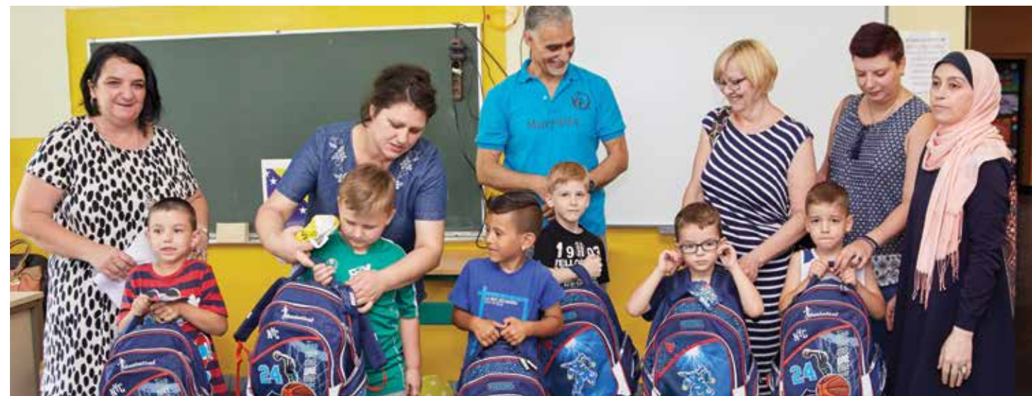
Backpacks filled with school supplies went to first graders in six schools in Bosnia for the second year.

more than 400 backpacks filled with school supplies for children in kindergarten through 5th grade. We also distributed teacher care kits containing supplies like tissues, printer paper, dry erase markers and more. Teachers often spend from their own pockets to supply their classrooms with items needed to teach and maintain hygiene.